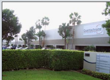
Quantachrome Instruments' Corporate Headquarters in Boynton Beach, Florida.

Quantachrome Instruments 1900 Corporate Drive Boynton Beach, FL 33426 USA Phone: +1 800 989 2476 +1 561 731 4999 Fax: +1 561 732 9888 E-mail: qc.sales@quantachrome.com www.quantachrome.com